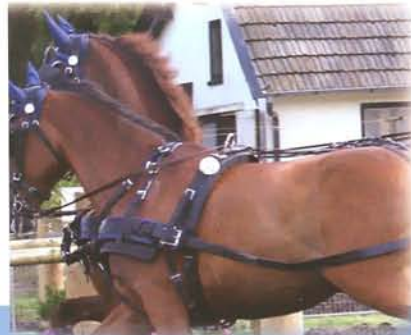
Breastplate - Elite Style