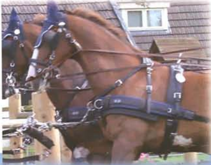
Breastplate & Traces - ZGB Style

The EXELL harness is a combination of ZGB & ELITE harness put together to form the ultimate team set, as specified by leading 4-in-hand driver/trainer, Boyd Exell.