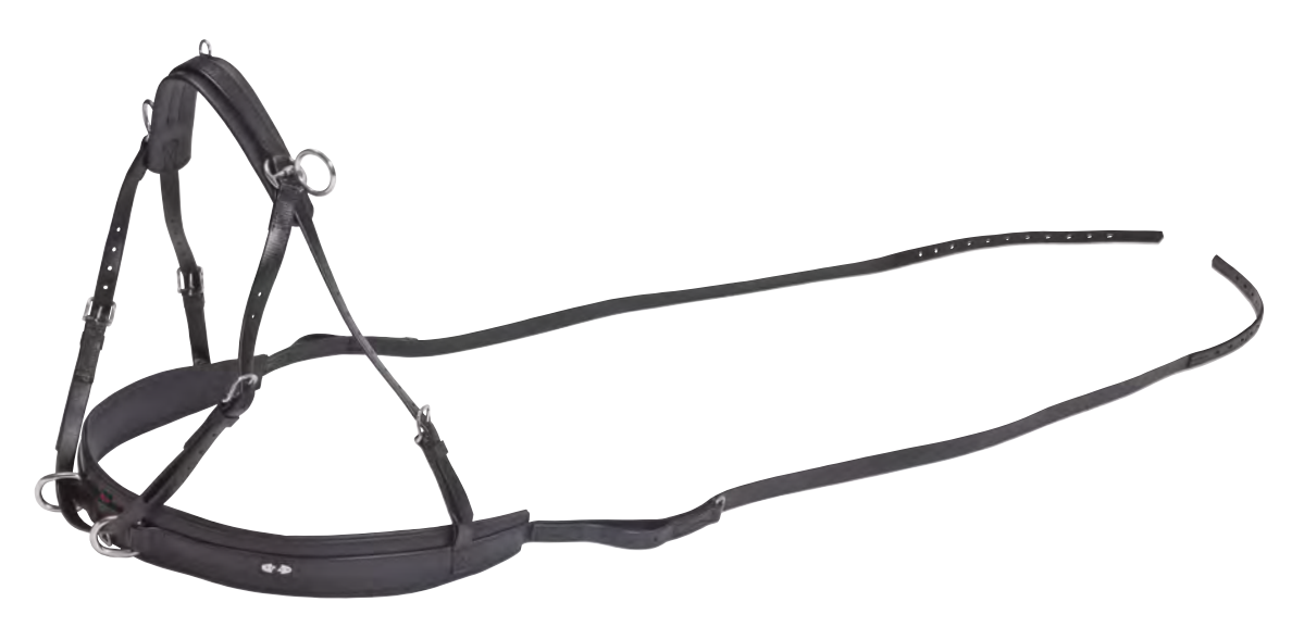
^{*}\mbox{Length} is measured from the centre of the Breastplate to the furthest trace hole.

Pony 185cm (72 3/4") 483304 Cob 225cm (88 1/2") 483306 Full 250cm (98 1/2") 483308