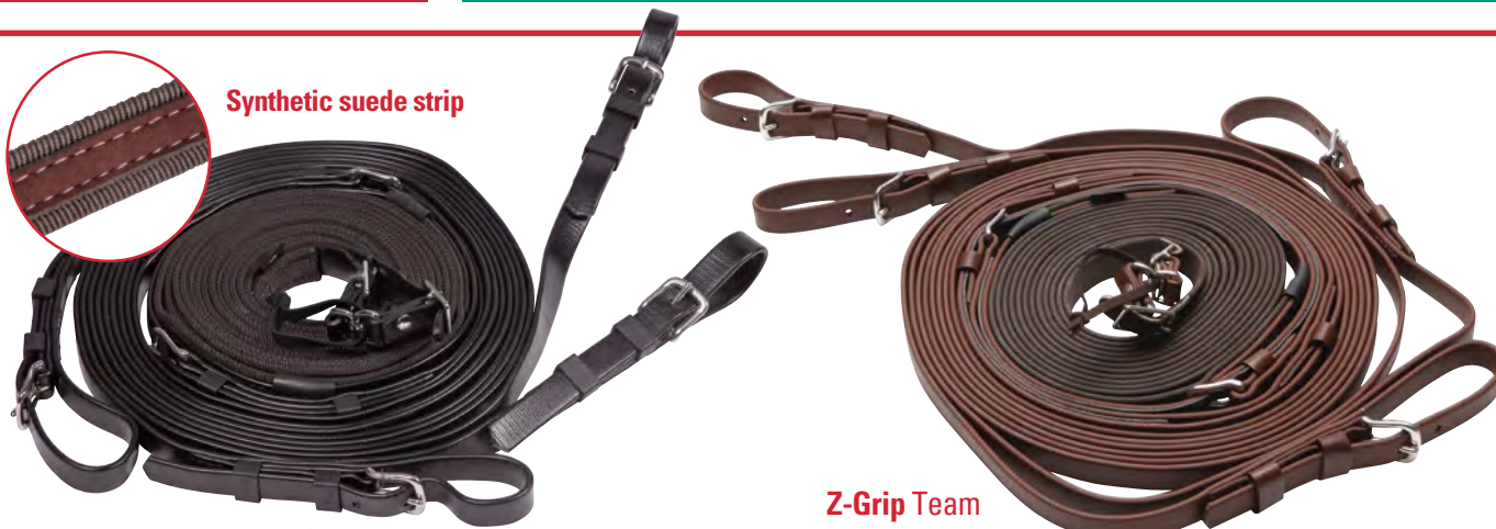
Synthetic suede strip