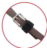
Fitted to rein