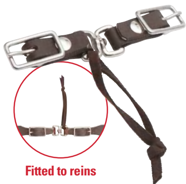
Fitted to reins