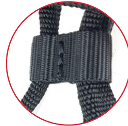
Adjustable Winker Stay