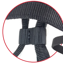
Adjustable Winker Stay