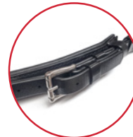
Crank on back